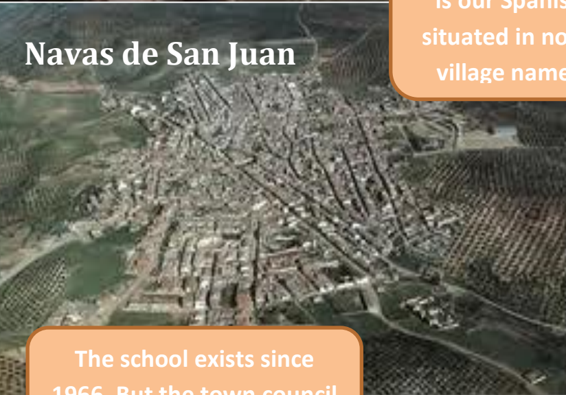
Navas de San Juan

The school exists since 1966. But the town council exists since 1924.